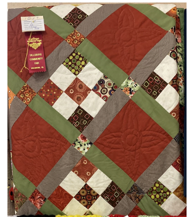
To the right: Retrofusion Quilt