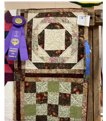
Above: Best in Show!

The Maple Shade Quilters will also be selling fiber merchandise and displaying quilts for your enjoyment!